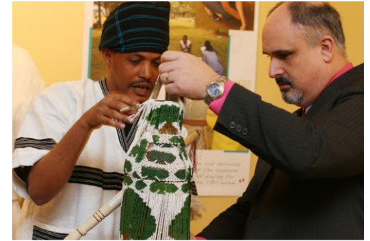
ATTSVE will foster collaborative partnerships among the participating ATVETs and external stakeholders.

By improving the ability of the ATVET colleges to design and implement gender and sustainable management strategies in addition to improving their infrastructure, ATVETs will have an increased capacity to implement innovative management strategies and provide high quality training that responds to labour market needs of private and public sector active in commercial agriculture.