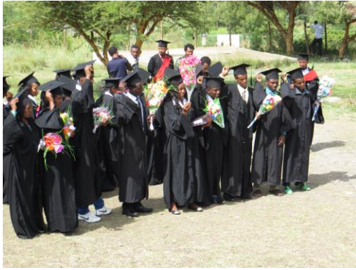
Utilizing the underused populations of rural areas of Ethiopia (youth and adult females) is a goal of ATTSVE.